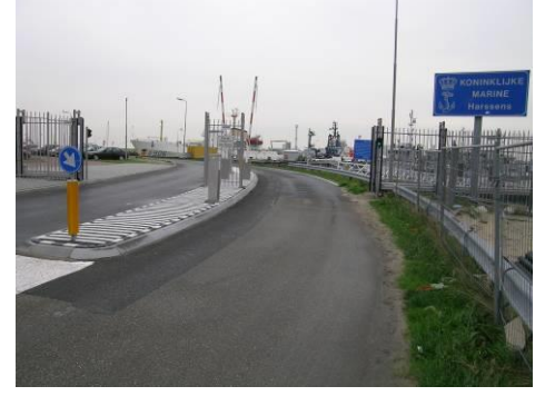
6 At the end of the lane there is an unmanned Navy gate. Report at the Navy security (intercom) that ENDURES is the destination.