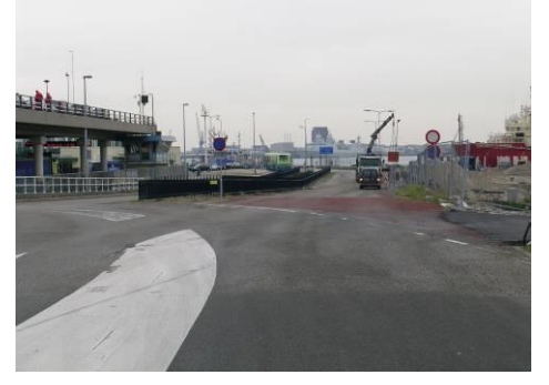
5 Do not follow the road towards the ferry station, but enter the lane on the right side.