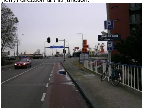
3 Immediately after having crossed the bridge turn left at the junction with traffic lights.