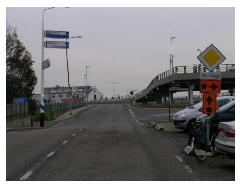
4 Following the road, pass another bridge until having reached this T-junction. Turn right.